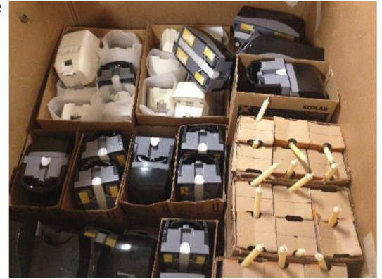
Old dispensers and soap packaged ready for donation

The ability to identify and capitalize on green opportunities within regularly scheduled projects is part of what has helped LifeBridge Health and Sinai Hospital create impactful programs. In May 2014, more than 2,000 new soap dispensers were set to be installed house-wide. One of the first questions to be asked was, how to responsibly dispose of the old units?