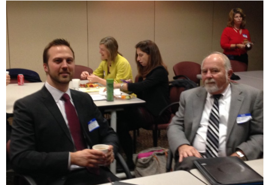
Attendees network over breakfast at the Trailblazer Education Event